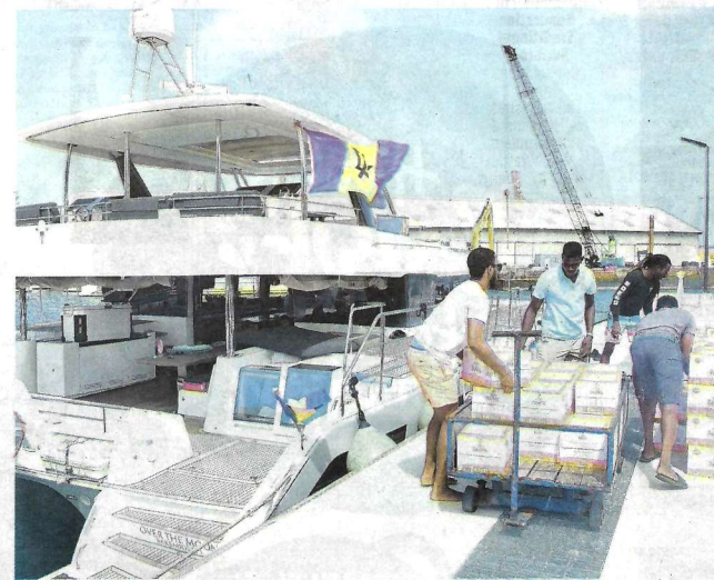
Some of the volunteers lifting supplies onto the Cat & The Fiddle boat at the Shallow Draught yesterday.