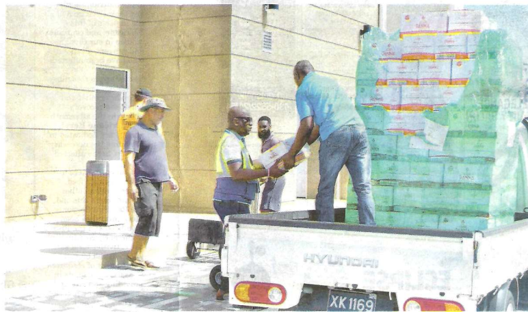
Representatives of corporate Barbados and individuals joined with the catamaran fraternity to assist with the Hurricane Disaster Relief for St Vincent and the Grenadines. Many of the supplies will be heading to Union Island and Mayreau today.

National Emergency Management Organisation (NEMO) of St Vincent and the Grenadines, who helped them get clearance for the items.