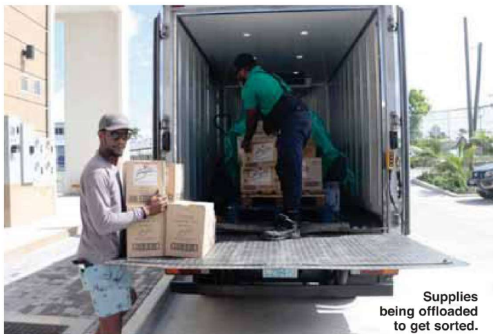
Supplies being offloaded to get sorted.